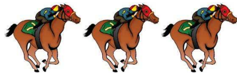
Melbourne Cup Day! Melbourne Cup Day! Melbourne Cup Day!